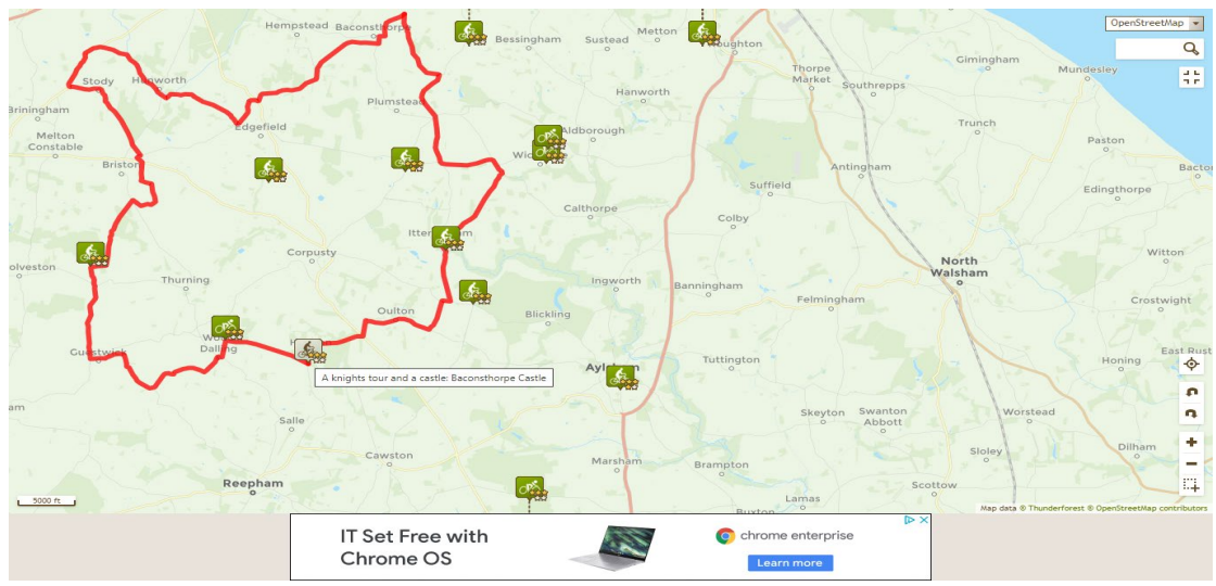
(Figure 2) Cycle route off Link 75/ Itteringham

As part of the road intervention scheme along The Street there will be the loss of verges to accommodate the proposed passing places. This will limit the safe refuge for those who will be using Link 68 on foot. There are plenty of people who walk/jog this route, especially local people who walk their dogs on the road, due to the limited number of public rights of way in this part of the village.