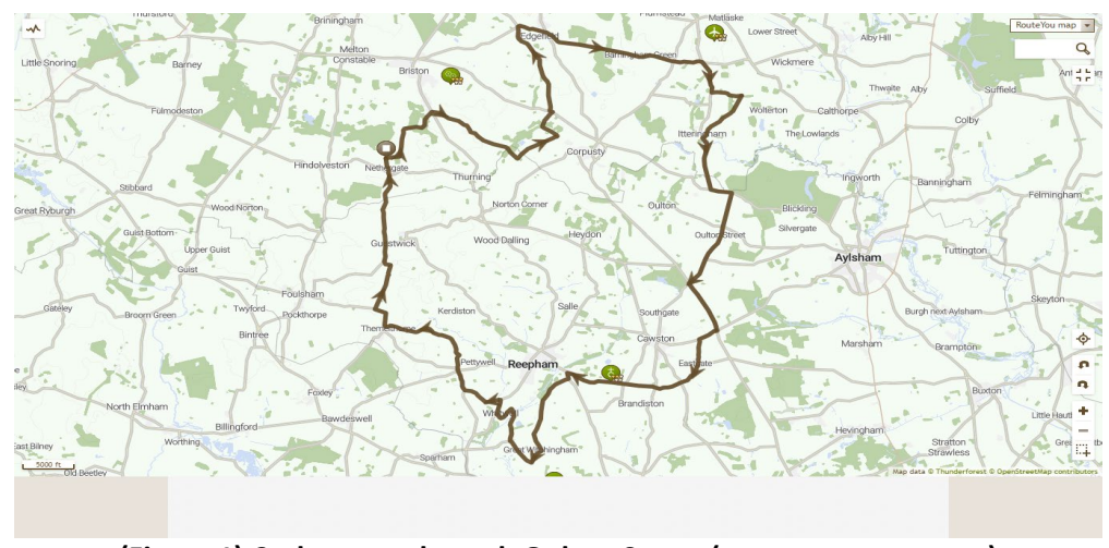
(Figure 1) Cycle route through Oulton Street (www.routeyou.com)

In fact, there are 3 designated cycle routes (figure 1-3) that pass either along or near Oulton Street.